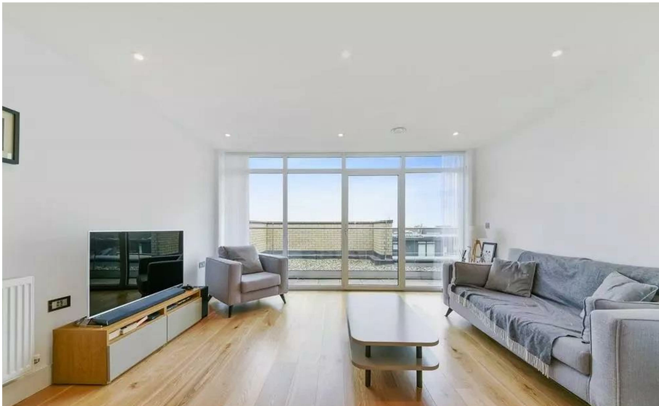
52 1 Grove Place, Eltham, London, SE9 5AA £1,800 Per month